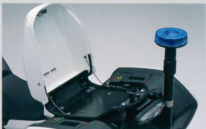
Large rear box for radio equipment.