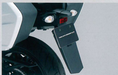
Long rear fender