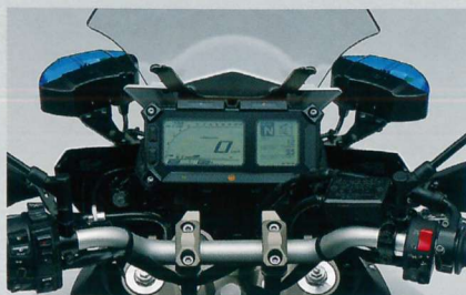
Equipped with the multi-dot LCD meters.

D-MODE (driving mode switching system) for achieving environment-compatible driving. Selectable from "STD-mode" (standard), "A-mode" (sharp and direct response), and "B-mode" (calm and tractable output characteristics).