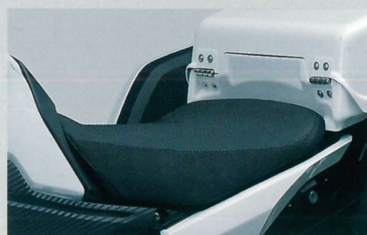
The well-cushioned seat comes with a two-step height adjustment (15 mm).