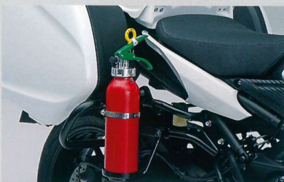
The rear bumper with a fire extinguisher holder.