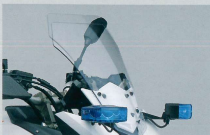
The three-step adjustable high windshield (manually operable) protects the driver against driving wind.